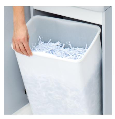
ENVIRONMENTALLY FRIENDLY BIN Durable, lightweight shred bins can be used with or without disposable bags.