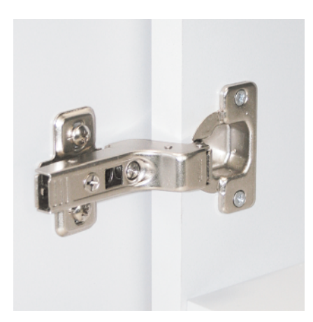
QUALITY COMPONENTS Cabinet doors are equipped with high quality adjustable metal hinges.