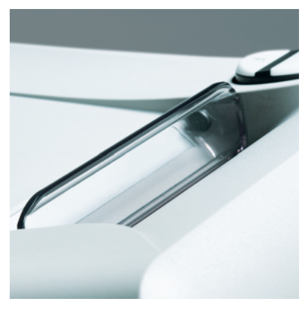
PATENTED SAFETY SHIELD Electronically controlled, transparent safety shield keeps fingers out of the feed opening.