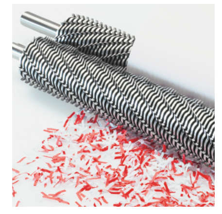
SOLID STEEL CUTTING SHAFTS High grade, hardened steel cutting shafts are milled in our Balingen factory and warranted for life.