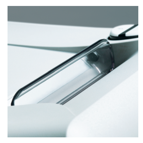
PATENTED SAFETY SHIELD

Multifunction control element uses optical signals to indicate operational status and functions as an emergency stop switch.