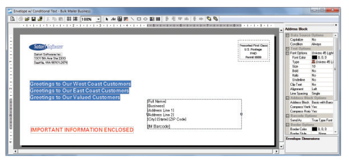
The mail piece designer offers full graphics support and even shows the print zones supported by your printer